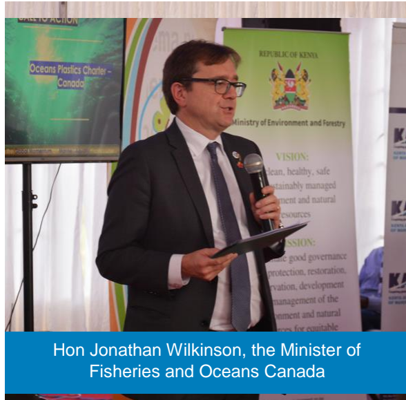
Hon Jonathan Wilkinson, the Minister of Fisheries and Oceans Canada

The Minister of Fisheries and Oceans Canada, Hon Jonathan Wilkinson mentioned that the Government of Canada has allocated $100 million in funding commitments to support the objectives of the Ocean Plastics Charter. This includes: