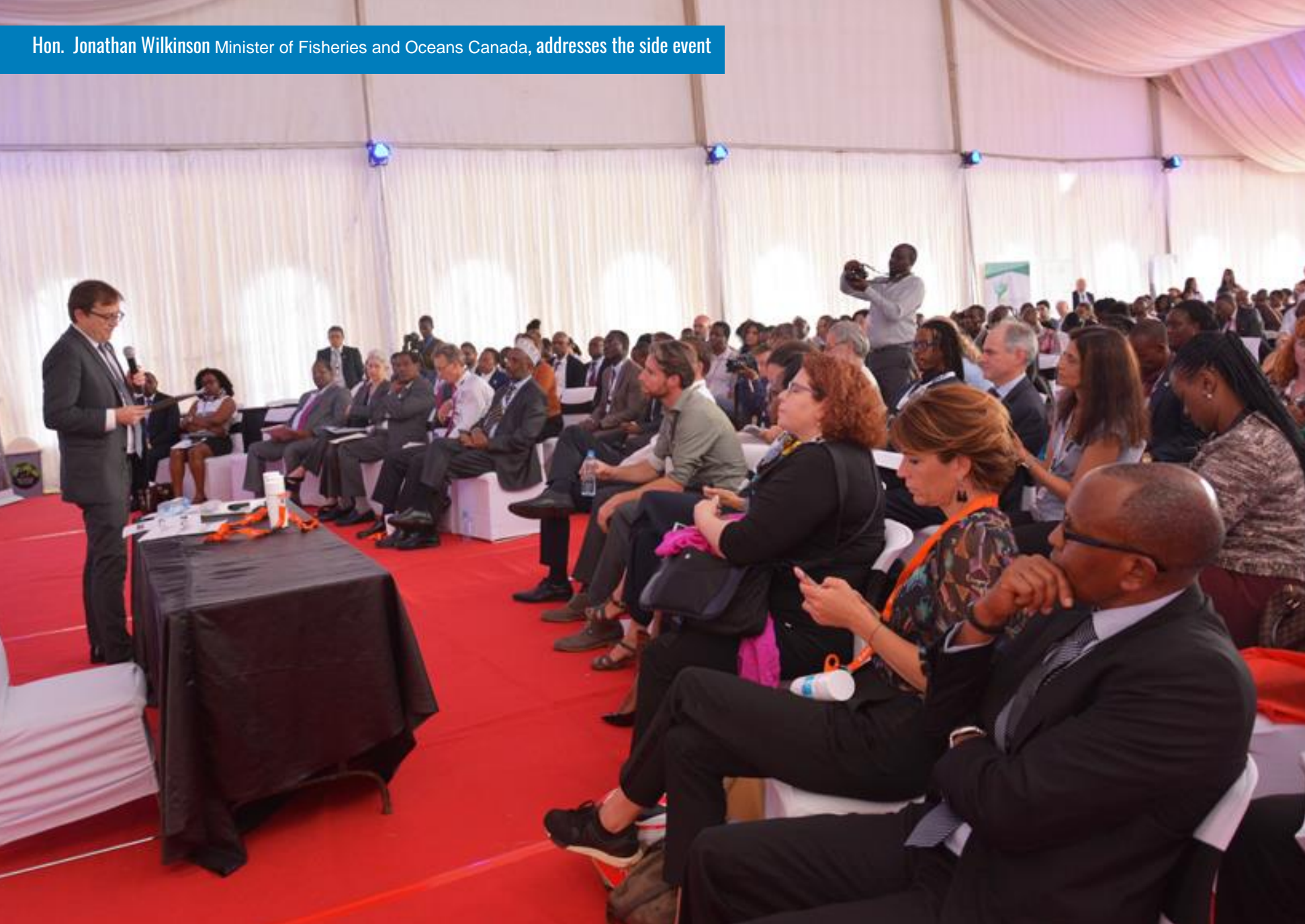
Hon. Jonathan Wilkinson Minister of Fisheries and Oceans Canada, addresses the side event