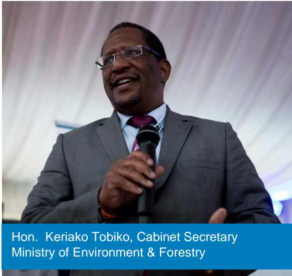
Hon. Keriako Tobiko, Cabinet Secretary Ministry of Environment & Forestry

Opening the session, the Cabinet Secretary Ministry of Environment & Forestry, Kenya, Hon. Keriako Tobiko highlighted the government's and political commitment to end the plastic waste menace in the country. He referenced successes of the recent ban on plastic carrier bags which has contributed to the reduction in plastic waste that ends up into the water bodies. He said that a lot still needs to be done hence a recent collaborative framework with industry and the private sector to find sustainable solutions to other plastic waste in the country. 'Specifically, on PET, the government has a collaborative framework with KAM to allow them to establish a takeback scheme,' he said.