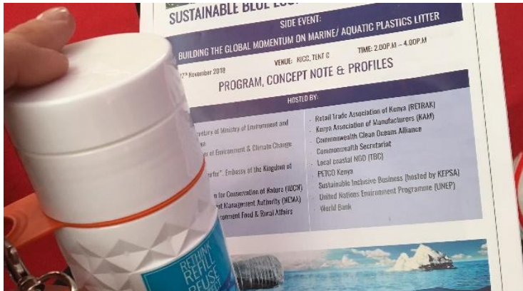
Reusable water bottle, provided for by the Embassy of the Kingdom of the Netherlands in Nairobi.