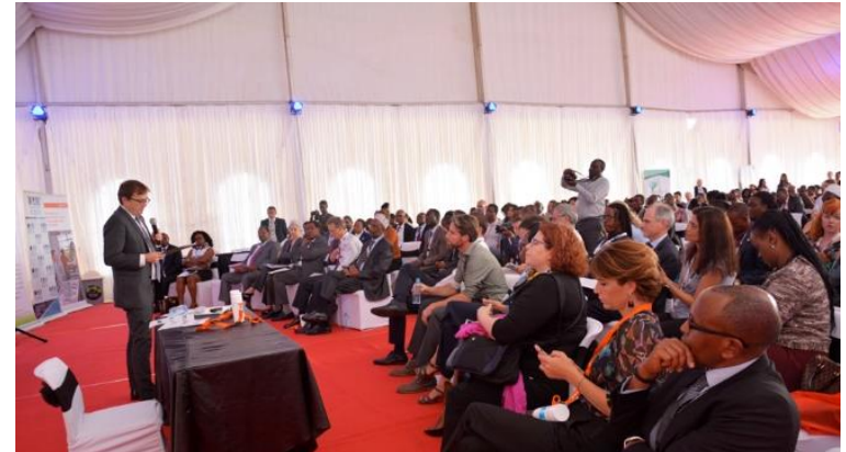
Hon. Jonathan Wilkinson, Minister of Fisheries and Oceans Canada, call to action.