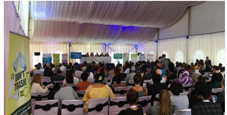
Fully packed auditorium as the session begins.