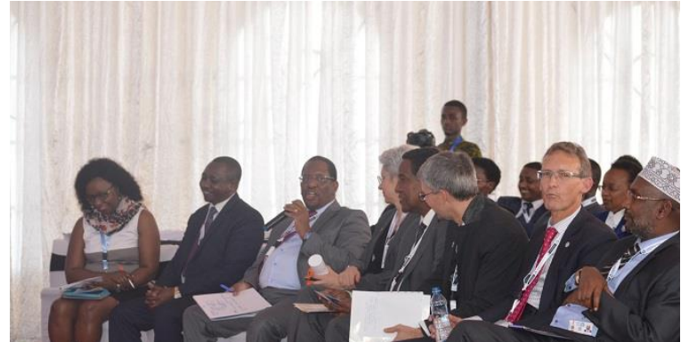
Hon. Keriako Tobiko, CS Ministry of Environment & Forestry responds to a question.