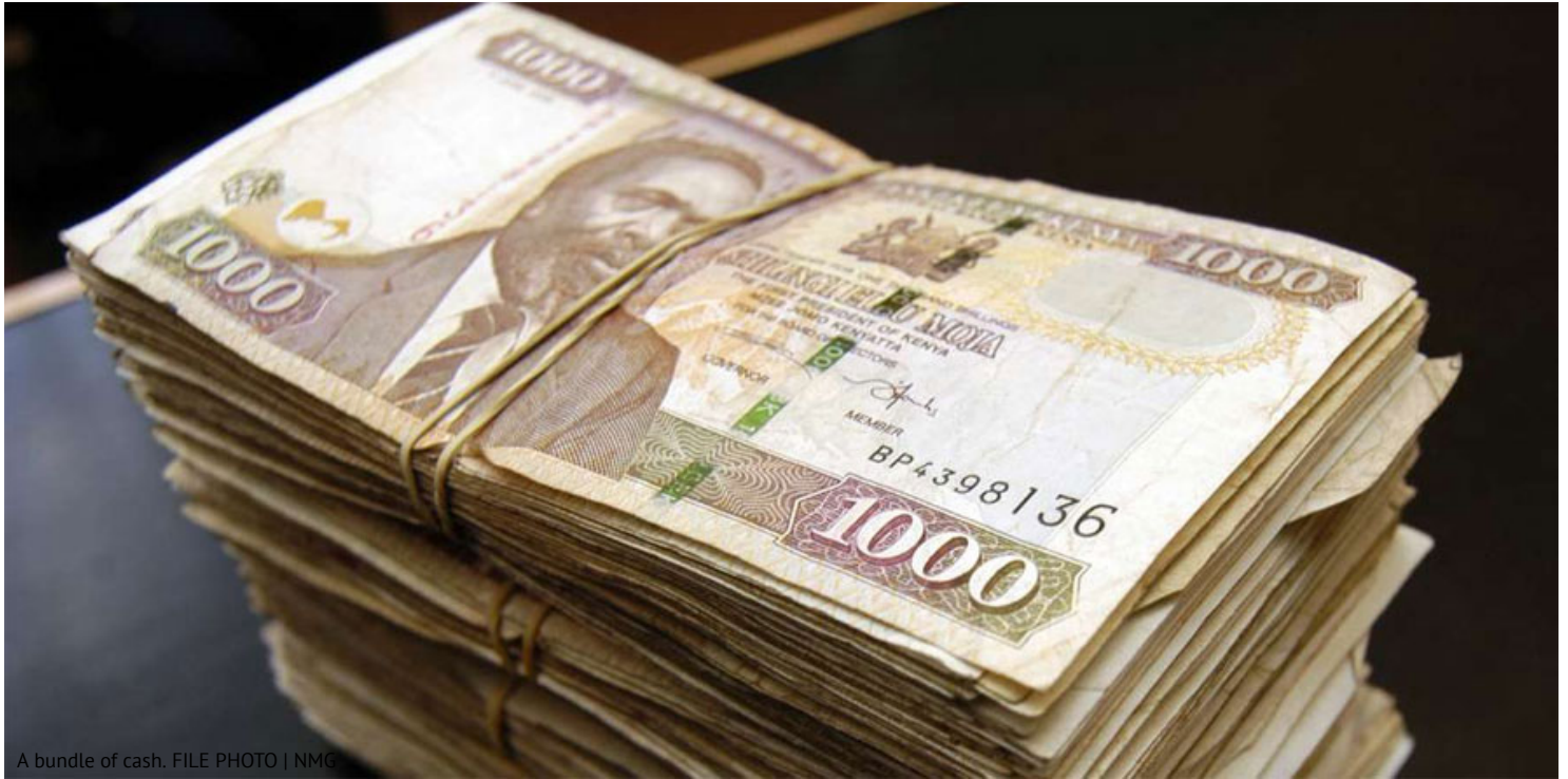
A bundle of cash.

Companies building businesses through supporting employee wellbeing initiatives as well as maintaining a zero-tolerance on pollution are the most sought-after by foreign companies seeking local trade linkages.